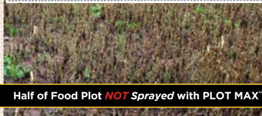
Half of Food Plot NOT Sprayed with PLOT MAX™