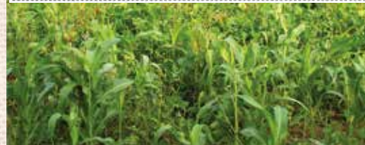
Half of Food Plot Sprayed with PLOT MAX™